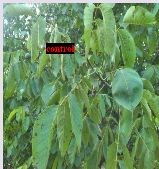
The effects of Waker mix & Tabak 15-5-30 on Walnut - Chaharmahal and Bakhtiari – Borujen - 2015