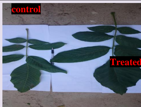
The effects of Bostano & 20-20-20 Aria on Walnut - Chaharmahal and Bakhtiari – Saman- 2015