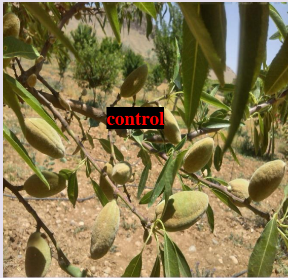
The effects of Waker mix & Hasmic on Almont - Chaharmahal and Bakhtiari – Borujen - 2015