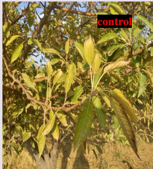
The effects of Diport on Almont - Chaharmahal and Bakhtiari – Borujen - 2015