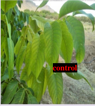
The effects of Diport & 20-20-20 Aria on Walnut - Chaharmahal and Bakhtiari – Borujen - 2015