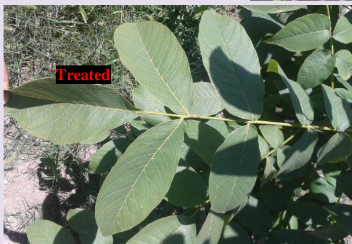
The effects of Waker Mn on Walnut – Mazandaran - Sari - 2015