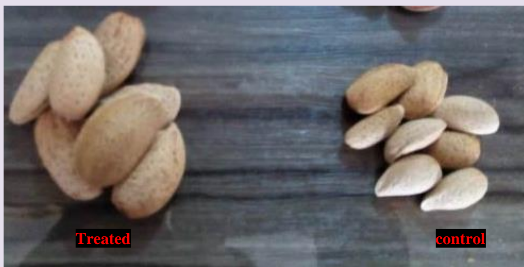
The effects of Ariashimi fertilizers on Almond - Chaharmahal and Bakhtiari – Shahrekord- 2015