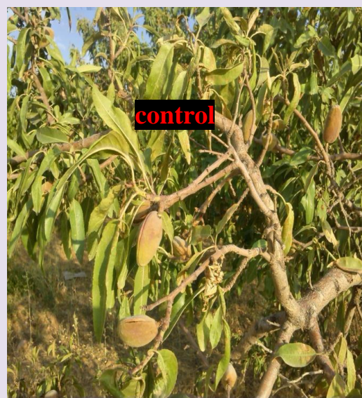
The effects of Tabak 15-5-30 on on Almont - Chaharmahal and Bakhtiari – Borujen - 2015